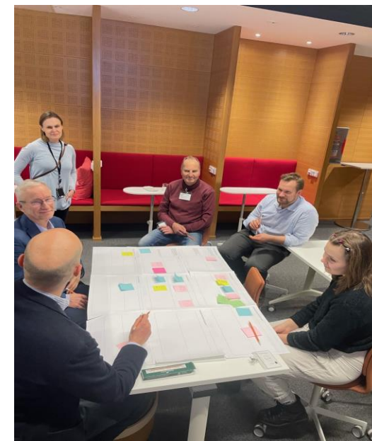
Helsinki Metropolitan Area